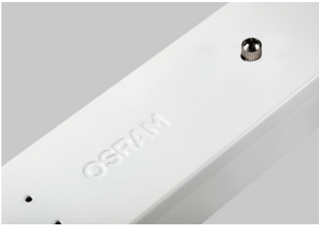
AirZing 5040 Product