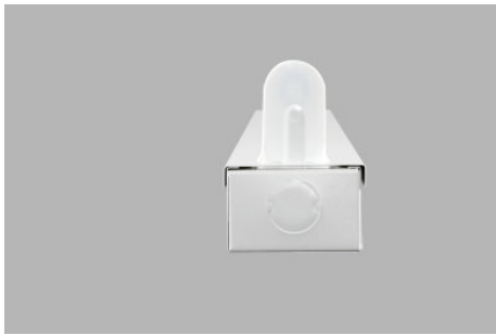
AirZing 5040 Product