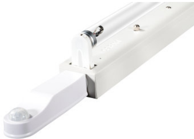
AirZing 5040 Product