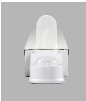
AirZing 5040 Product