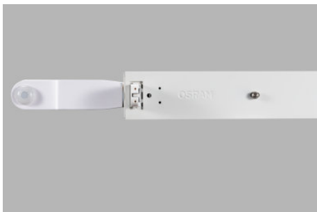
AirZing 5040 Product