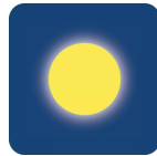
Amber when ON

Thanks to cutting edge interference and absorber coating