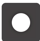
Cool White color temperature of 6,000 K

Better visibility thanks to daylight effect