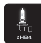
Very compact LED replacement for conventional HB4 high and low beam lamps

More light allows to see farther and therefore react sooner. Signs, obstacles and hazards can be recognized sooner