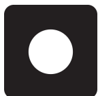
Cool White color temperature of 6,000 K

Better visibility in foggy situations with a perfect color match for xenon and LED headlights. Signs, obstacles and hazards can be recognized sooner.