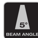
Beam angle 5°