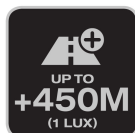
Lighting distance up to 450 meters